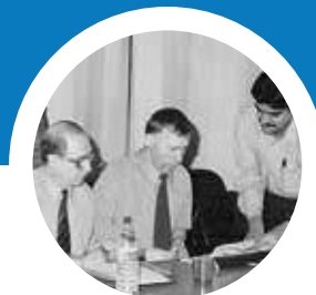
On Site Project Team